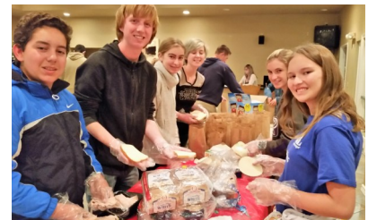
Assisteens: Shaping tomorrow's leaders today.

Assisteens and Assistance League members volunteer together to clothe students during Operation School Bell shopping events. Assisteens also enthusiastically volunteer at Assistance League Resale.